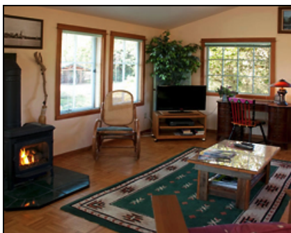
Aerial Cottage (Loft)

Separate dwelling with fireplace, stained glass, kitchenette, Queen size four poster & bath. $169.00 - $189.00 per night, single or double. TV/VCR /CD/STEREO